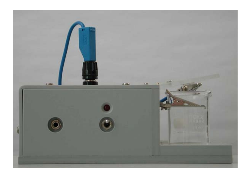
Figure 1: view of the ACl-01 apparatus

The A Cl -01 apparatus is a low-cost, fully automatic system for manufacturing chlorinated silver wires, which are widely used in electrophysiology (Ag-AgCl electrodes). The quality of recorded signals relies on a thorough preparation of the Ag-AgCl electrodes.