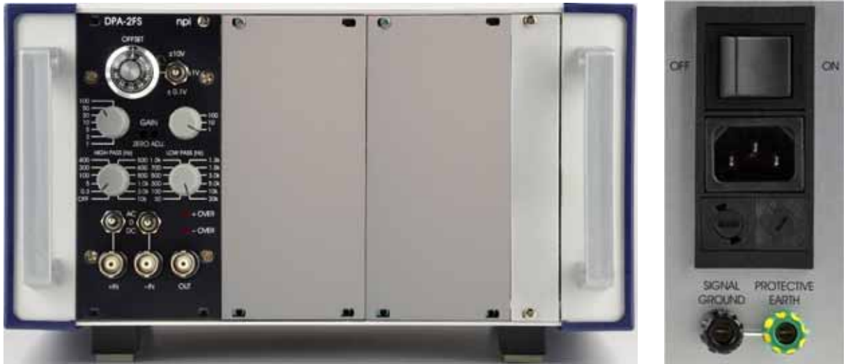
Figure 2: Left: front view of EPMS-03 housing. Right: rear panel detail of EPMS-03 and EPMS-07 housing.

In order to avoid induction of electromagnetic noise the power supply unit, the power switch and the fuse are located at the rear of the housing (see Figure 2, right).