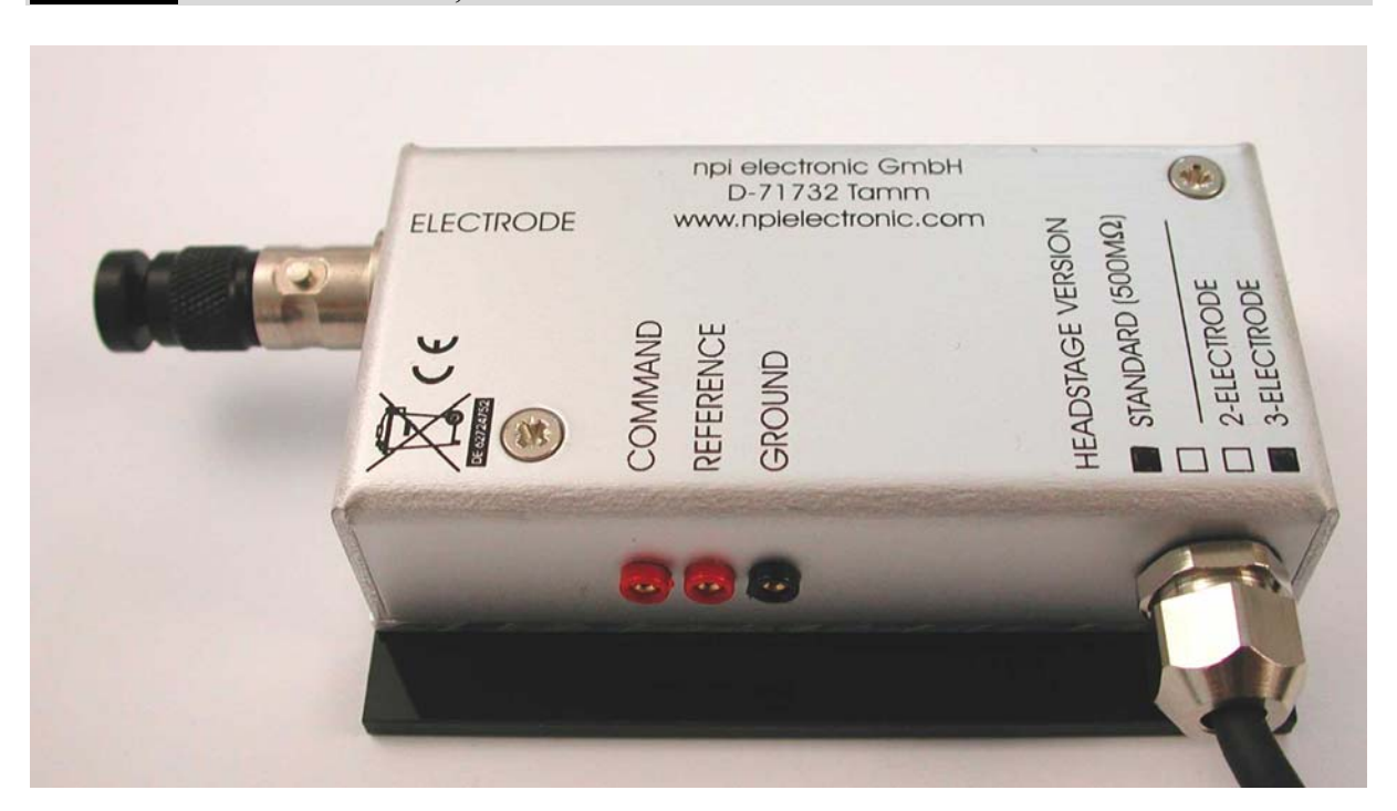
Figure 3: VA-10X 3 electrode headstage with CFE electrode holder (optional) Reference for typical application:

Marinesco, S. and Carew, T. J. (2002). Serotonin Release Evoked by Tail Nerve Stimulation in the CNS of Aplysia : Characterization and Relationship to Heterosynaptic Plasticity. J.Neurosci. 22 (6), 2299–2312.